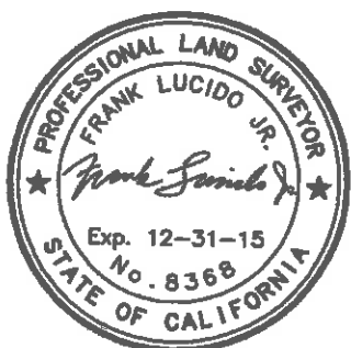
EXHIBIT "B" FOR GARDEN LEASE AREA

DEL REY OAKS COUNTY OF MONTEREY STATE OF CALIFORNIA